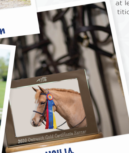
USHJA Outreach Champion