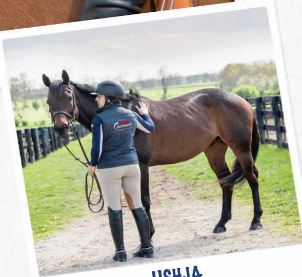
USHJA Outreach Champion