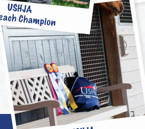
USHJA Outreach Champion