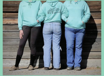
Trail Hoodie Sizes: S-5XL

Offering Kids, Mens and Womens in 20+ colors!!