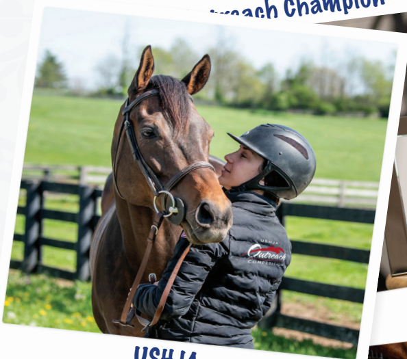
USHJA Outreach Champion